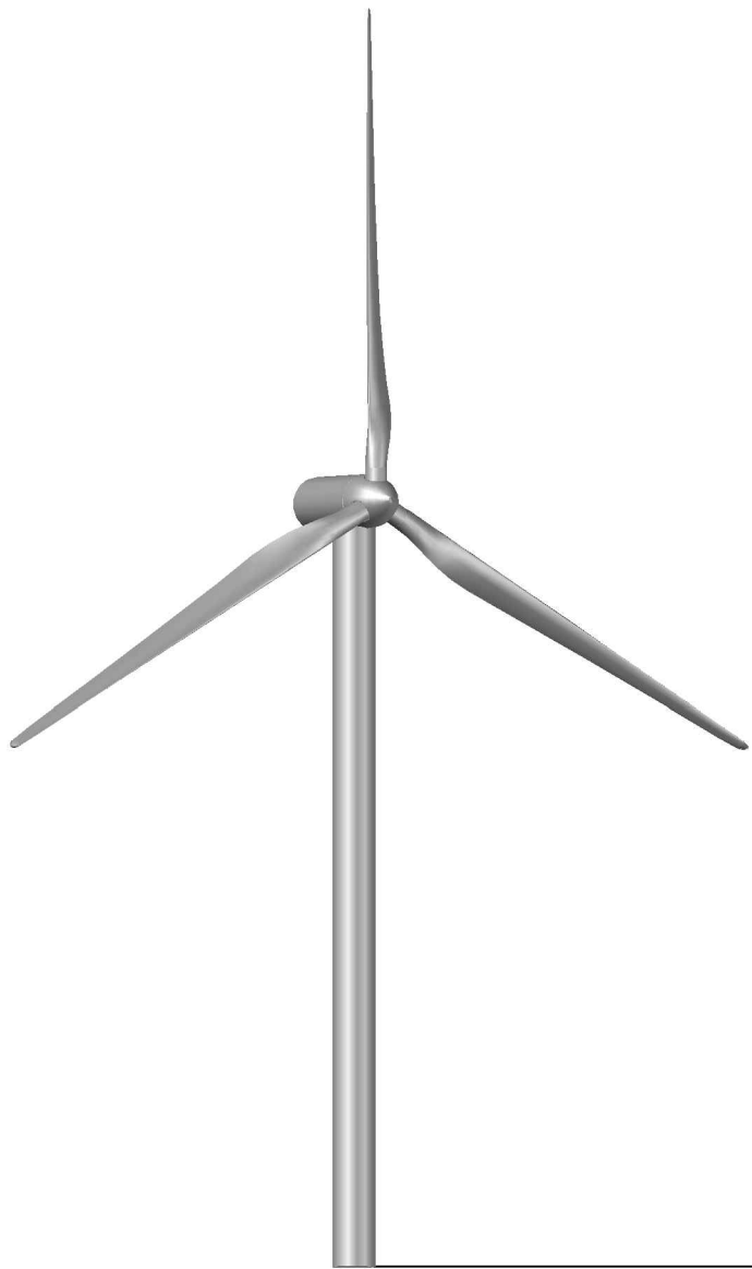
GAMESA 2.5 MW TURBINE 626'