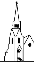
ST. MARY'S CHURCH 125'