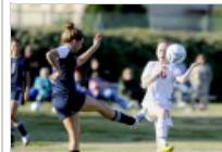
Prep Sports: May 9-15, 2011