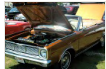
All Wheels car show, Movock, May 7