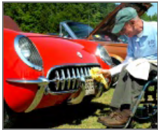
Annual All Wheels show held Saturday at Border Station