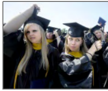
Fly high, ex-astronaut tells ESCU grads